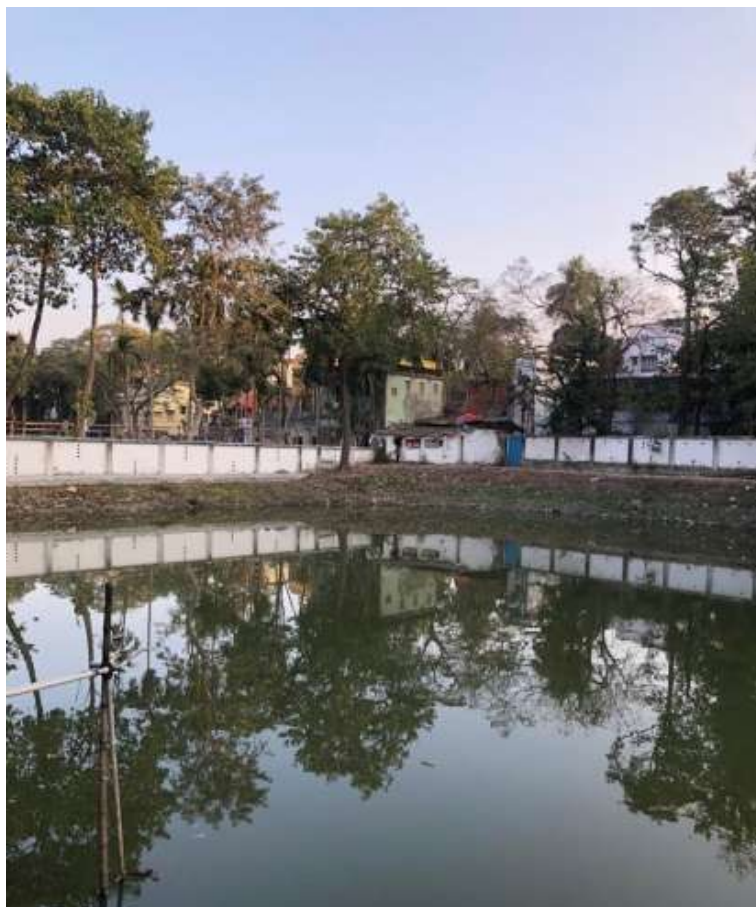
A healthy pond on the premises of Dinabandhu Andrews College