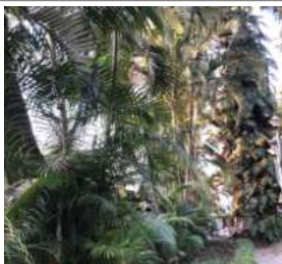
Some age-old trees in the garden of Dinabandhu Andrews College