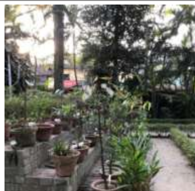
Layered gardening at Dinabandhu Andrews College