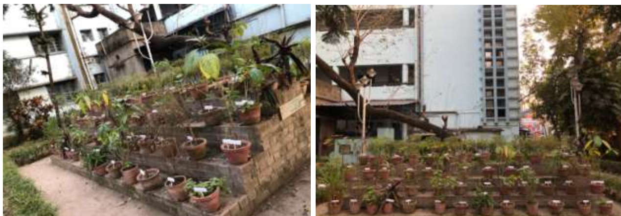
College maintains a good collection of plants of medicinal value