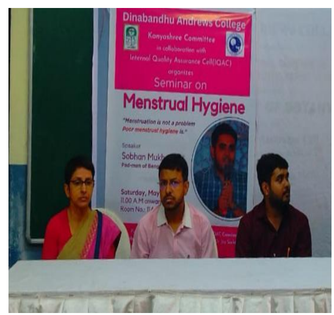
Seminar was conducted successful with the immense efforts of the respective coordinators.