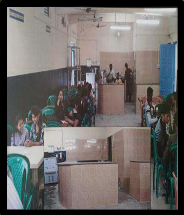
HEALTHY CANTEEN FOR STUDENTS