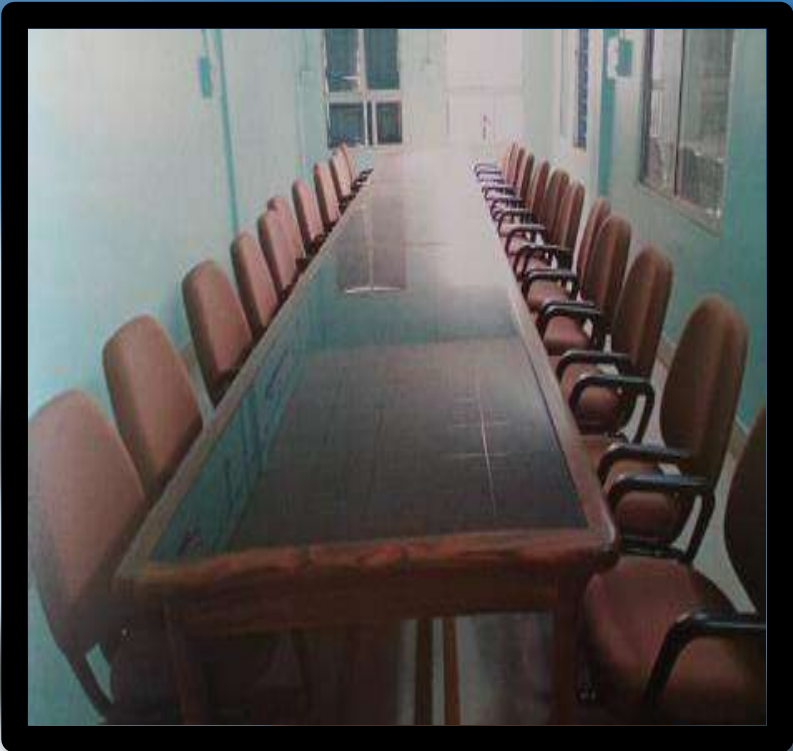
TEACHERS' READING CUM CONFERENCE ROOM