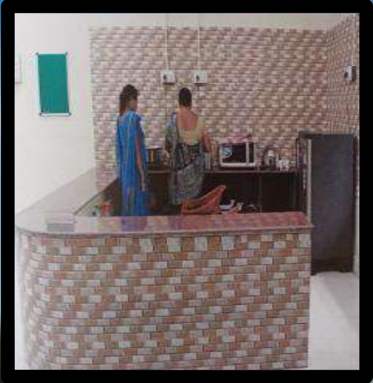
STAFF CANTEEN PRESENT AT THE 1 ST FLOOR